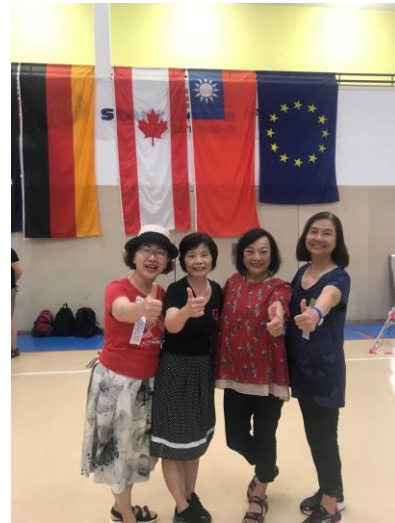
Fig 4. Participants of the Penguins Summer Dance, Denmark.

In February we had 5 members attending a 2-day challenge camp "If You Want" at Shizuoka, Japan. In July we had 4 dancers joining Penguins Summer Dance at Tranum, Denmark, and 8 dancers participating in iPAC at Barmstedt, Germany. Just coming back from Tokyo, 18 dancers had marvelous time at the JNACC. Other individual dancers also traveled to various events like Swedish National Convention, Challenge Circus in Tokyo, AACE and Cherry Ridge in the USA, etc. Besides dancers, some callers also extended their enthusiasms to gain international recognitions. For instance, Jack Hsieh, leader of the Seasons Club, gave calls at the 3rd Slovak Convention, and Nancy Chen performed at several sessions in the 2019 JNACC.